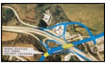
One of seven options from the 2003 Project Study Report

Adopt General Plan and zoning amendments to create a mixed-use residential neighborhood along the South Broad Street corridor from South Street to Orcutt Road and seek grant funding to create a neighborhood concept plan for the area.