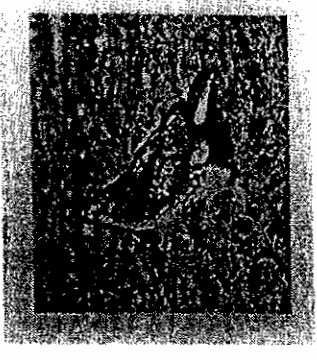
This hawk is just one of many beautiful creatures seen around Bishop Peak.