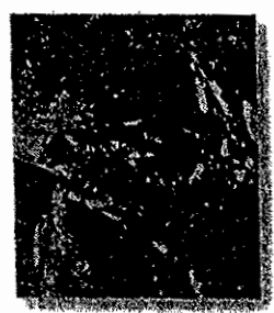
Trail hiking provides a quality family activity for all ages and levels.