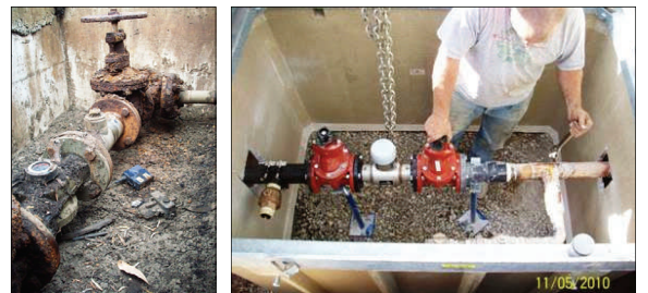
Infrastructure Equipment - Before and After