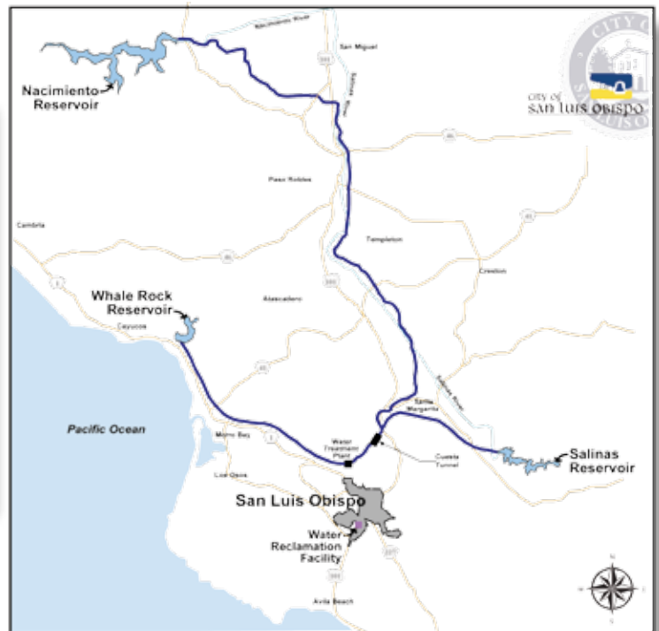
FIGURE 1: Multi-Source Water Supply

The multi-source water supply strategy has created a very secure and reliable water supply for the community and is something we can all be proud of. In the next Resource, we will look at the water treatment system.